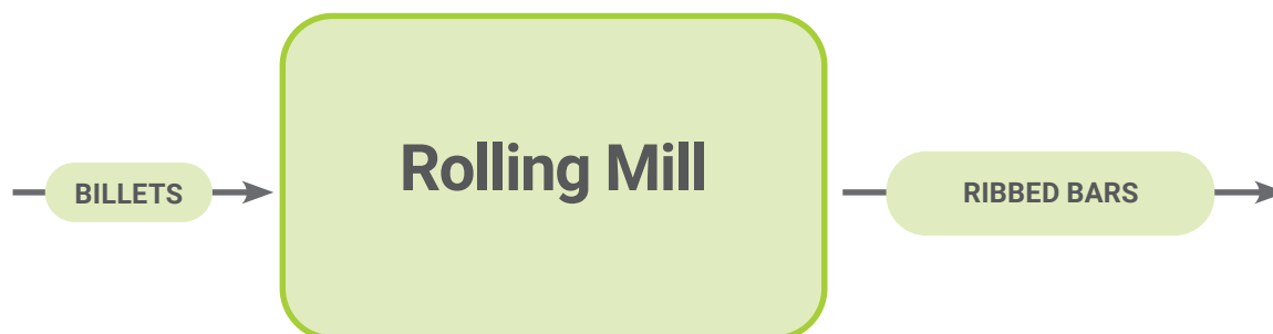
Fig. 1 Flow diagram